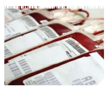
ACCURATE, TIMELY AND POWERFUL DATA MANAGEMENT CAN MEAN THE DIFFERENCE BETWEEN LIFE AND DEATH, IN A HOSPITAL OR A BUSINESS.