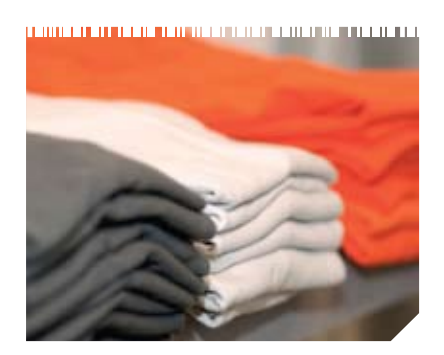
RETAILERS KNOW THE VALUE OF THE RIGHT MERCHANDISE IN THE RIGHT PLACE, AT THE RIGHT PRICE- MCL MAKES IT EASY AND FAST.